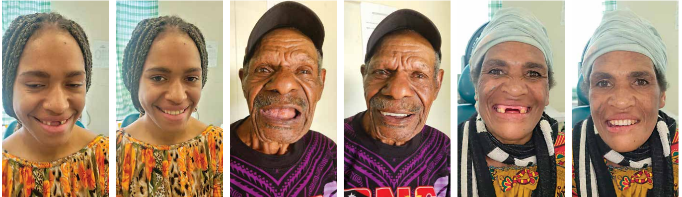
Before and after photos of three patients.