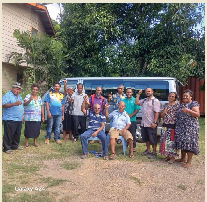
POM Team pose for a picture with their new bus.

It's a reminder that even in challenges, God provides – through His people, in His perfect timing.