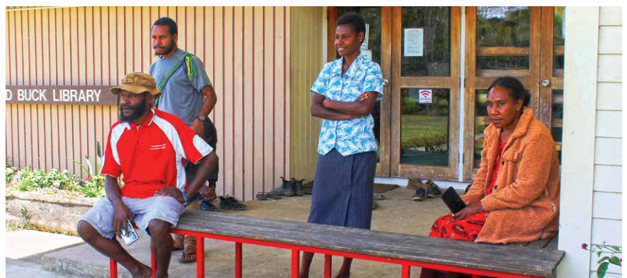
Students outside the library

Thank you for considering this opportunity to make a real difference in the lives of our students. With your help, we can keep theological education accessible, sustainable, and impactful for Papua New Guinea and beyond.