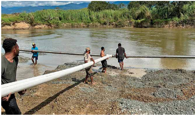
Ensuring clean safe water from the Waghi River.