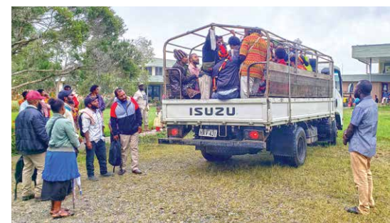
Students going out on outreach

This year's increase in enrolment is a testament to the demand for quality theological and vocational training and the importance of CLTC's mission. We look forward to serving more students and further developing our facilities to meet these growing needs. Thank you for your continued support in helping us fulfil our calling to equip future leaders for ministry and service.