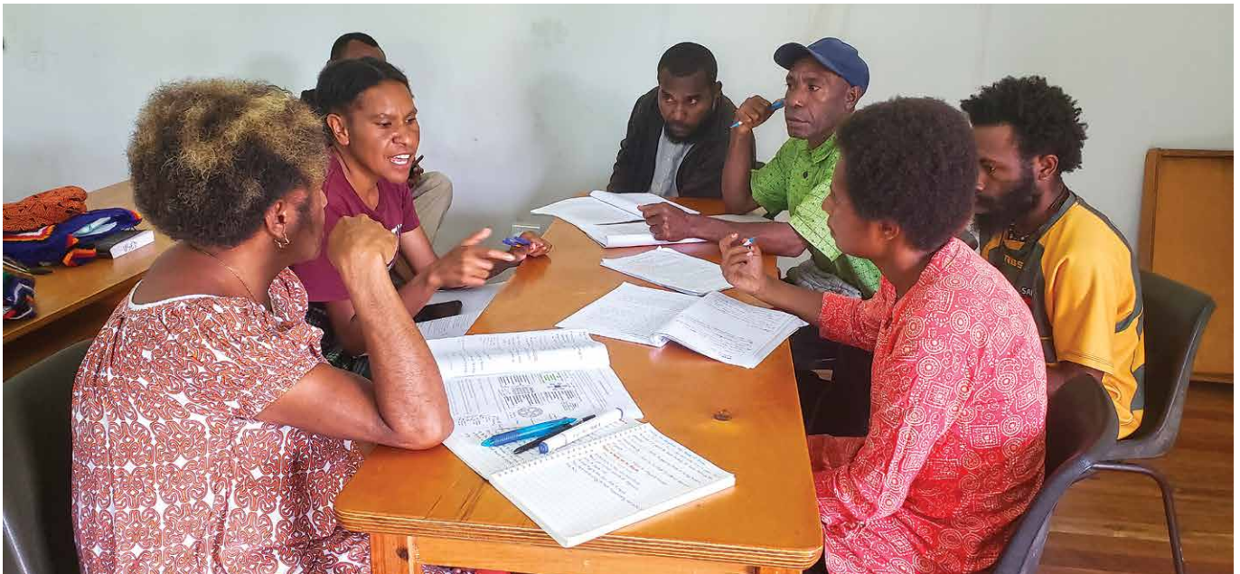
Student group in class.