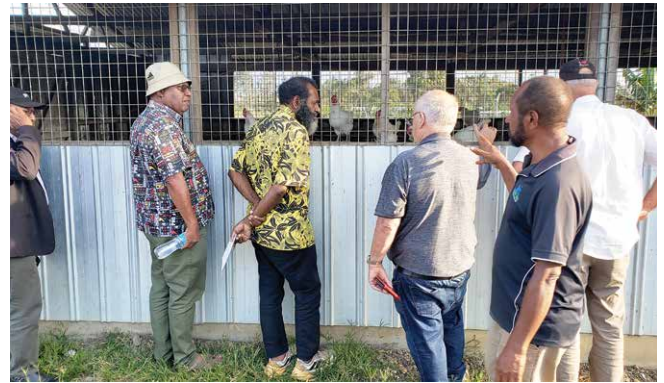
Council members looking at the chicken sheds